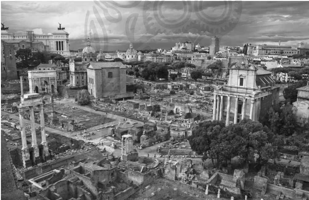
Official announcements, like the proscriptions, were published in the Forum Romanum. In Cicero's day, the rostra that would have been located by the triple arch in the left corner of the photograph served as a public speaking platform. Following his murder, Cicero's tongue and hands were displayed on the rostra.

vellet – an imperfect subjunctive indicating possibility